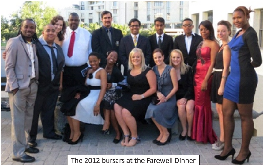
The 2012 bursars at the Farewell Dinner

much easier by the fact that my first experience of Oxford was with Fellow Abes and allowed me to "come home" when I relocated. For that, and all the personal and professional connections I have made since, I will be eternally grateful. Many thanks for the newsletter, for which I am always grateful. I just noticed one of my contemporaries from UKZN (who was also at Oxford at the same time as me) is back in Oxford reading for a DPhil. One of the real downsides of giving up social media is that you do, to an extent, lose contact with your wider network and so it is really rather something to learn about her progress through the Abe newsletter. The service you do to our community is so very appreciated"