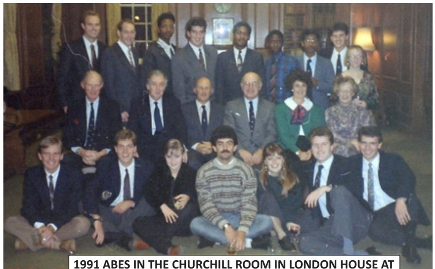
1991 ABES IN THE CHURCHILL ROOM IN LONDON HOUSE AT GOODENOUGH COLLEGE